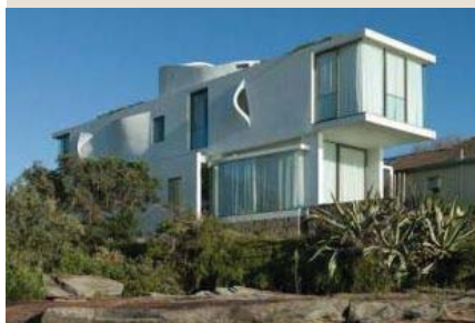
2012 award winner

Nominations for the Waverley Design Awards have now closed and we are asking you to vote for your favourite as part of the People's Choice Award.