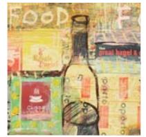
Eating Out Guide Page 12