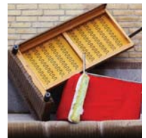
Dumping is Dumb Page 8