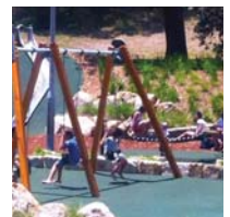
New play spaces in Waverley Page 12

Part of Seniors Week, recognising seniors who offer care in the community