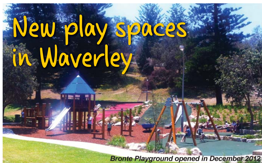
Bronte Playground opened in December 2012

We now have a number of exciting new and recently upgraded play spaces in Waverley. These include Bronte Park Playground, the Children's Learner Cycle Path at Dudley Page Reserve and Varna Park Playground.