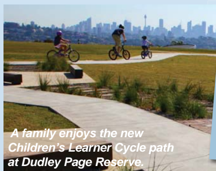
A family enjoys the new Children's Learner Cycle path at Dudley Page Reserve.

To have your say, please fill out our online survey at www.haveyoursaywaverley.com.au before 31 March.