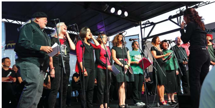
The Citizens at the 2012 Bondi Wave concert