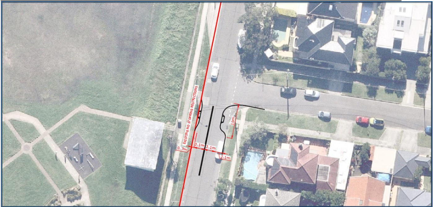
Figure 3. Option 2 ☐ Kerb buildout (preferred option).