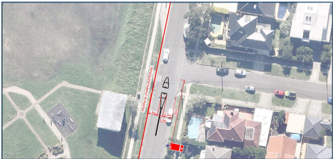
Figure 2. Option 1 ☐ Pedestrian refuge.