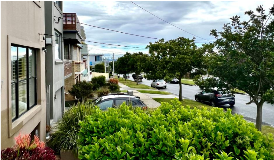
Image 3: Newly Trimmed Tuckerroo Trees on South Side of Myuna Road STILL blocking Pre Existing Harbour views