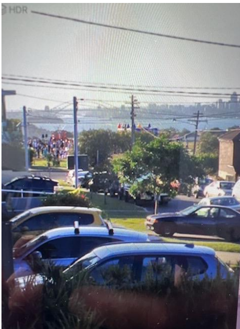
Image 1: Pre - Existing Views of Sydney Harbour from Residents on South Side of Myuna Road