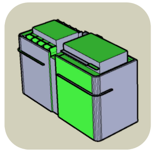
Figure 2: Not acceptable – Model with both inward and outward facing

All faces of the model need to be directed outwards, i.e. Outward facing normals. (Check this on SketchUp by turning on the monochrome face style.) Please refer to Figures 2 and 3 for more information.