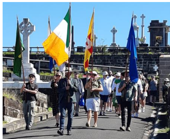
The flag party approaches the Irish Memorial