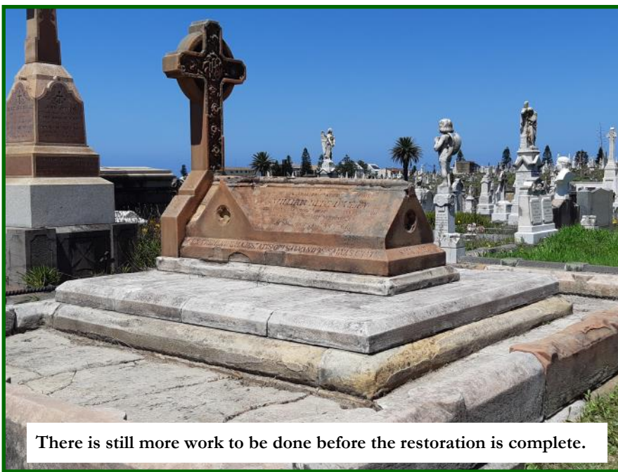
There is still more work to be done before the restoration is complete.