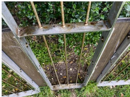
Inferior 316 Steel Newly Installed in Hugh Bamford - Tell Council We Want 2205 Steel For The Cliff Walks