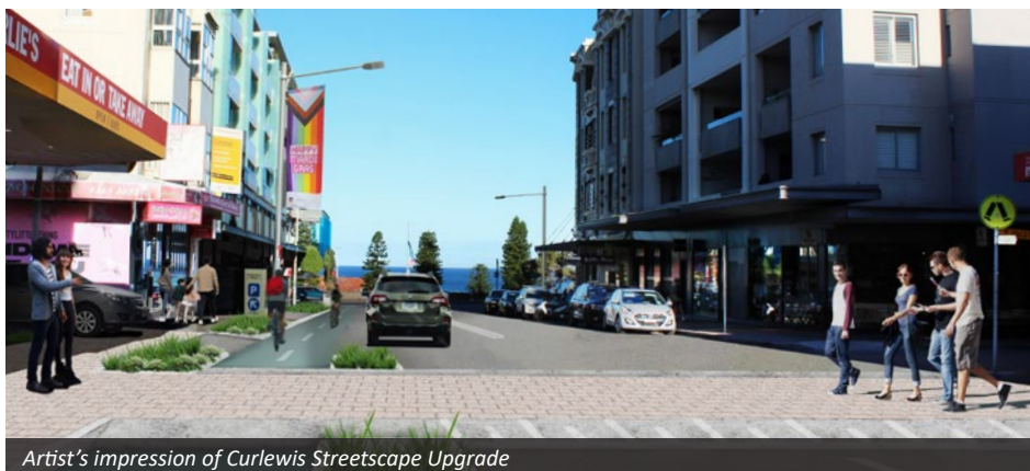
Artist's impression of Curlewis Streetscape Upgrade