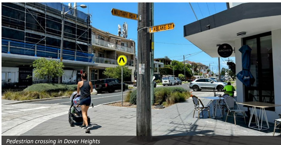
Pedestrian crossing in Dover Heights