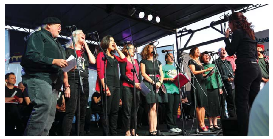
The Citizens at the 2012 Bondi Wave concert