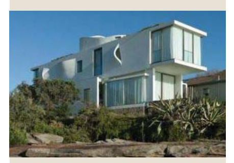
2012 award winner

Nominations for the Waverley Design Awards have now closed and we are asking you to vote for your favourite as part of the People's Choice Award.