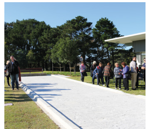
Newly completed bocce court

Waverley Park is now home to a new bocce court and upgraded cricket nets. We're installing synthetic turf on the field next to the Oval (playing field 2), we'll be putting in improved sports lighting and building three new multipurpose courts. This will help increase access to much-needed sporting facilities by local kids' sporting teams and adults.