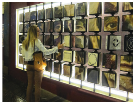
Giant Gray Street Jigsaw pop up

2. Urban Interventions – these interactive projects have been very popular and include the Urban Lounge, which provides additional public seating in Spring Street, a giant wall Jigsaw on the corner of Gray Street and Bronte Road and a bike hub with space for 10 bikes on Bronte Road. Watch this space – more will be revealed soon.