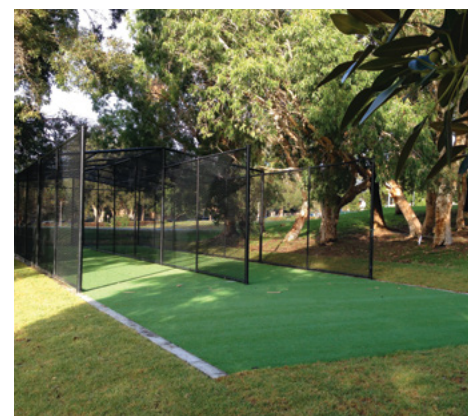
Upgraded cricket nets