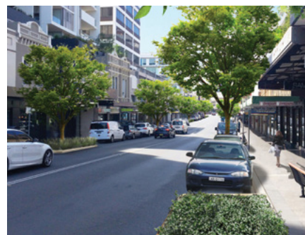
Artist’s impression of Oxford Street revamp

3. More Greenery – we plan to install 90 square metres of garden beds and ten street trees along Oxford Street, between Denison and Newland Streets.