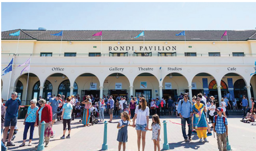
The iconic Bondi Pavilion

Our parks and open spaces are constantly in high demand so our focus is to make sure we have enough recreation facilities throughout the area. We're also making sure our parks look their best and cater to people of all ages.