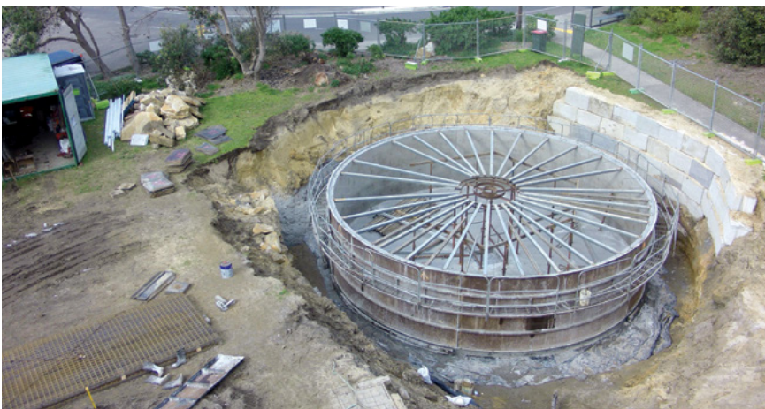
Construction of the stormwater recycling system

Kevin Bullock: “Reusing rainwater in toilets and the park is a win-win for us and the environment.”