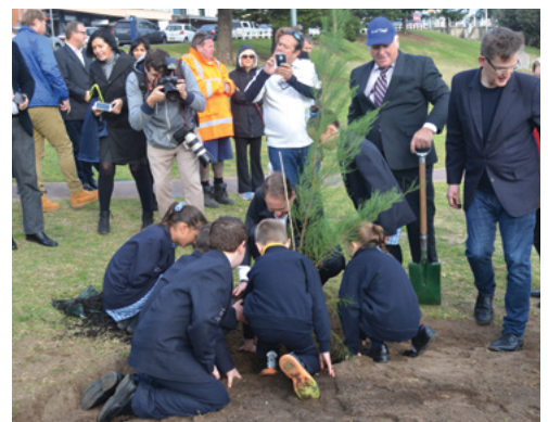
School kids planted new trees at Bondi Park for the launch of One Tree Per Child