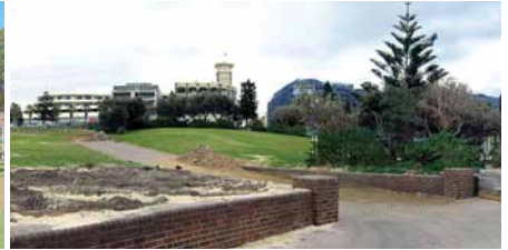
Our oval and new bocce court at Waverley Park and construction at Bondi Park

With just over 70,700 residents occupying 9.2 km 2 , there's no doubt our parks and open spaces are in high demand.