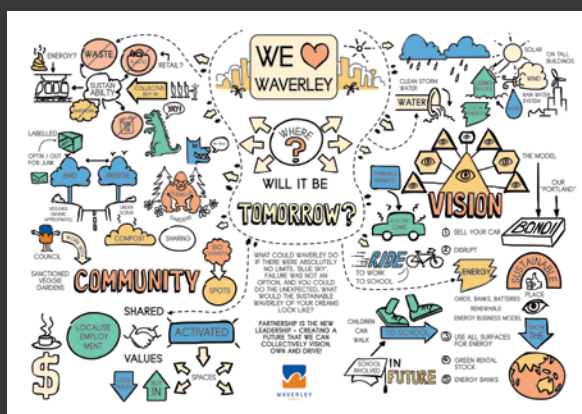
An illustrated representation of the communities vision.

Imagine there were absolutely no limits, failure was not an option and you could do the unexpected. What would the Sustainable Waverley of your dreams look like and how could we get there?