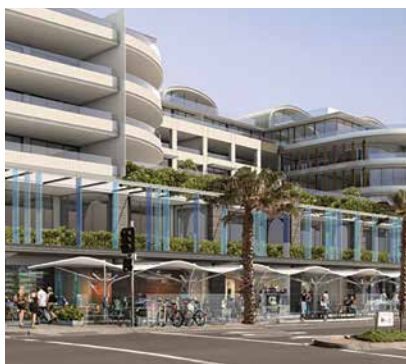
Top: Rowe Street's vibrant new look; Bottom: artist impression of the Campbell Parade planned upgrades