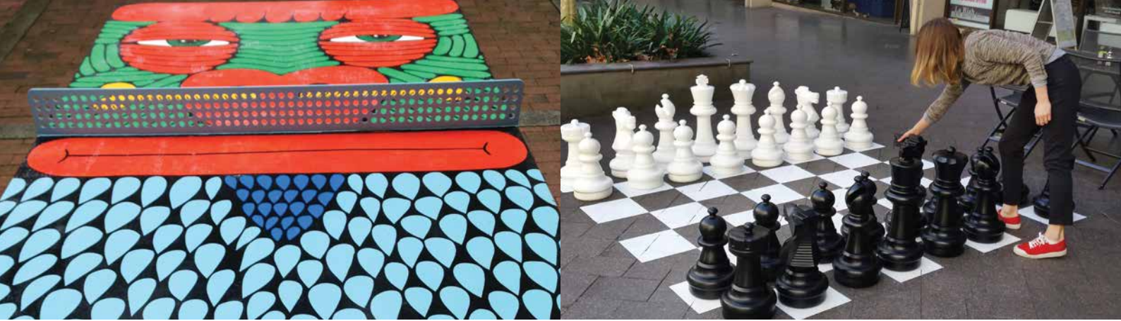
Pop up ping pong table and chess set