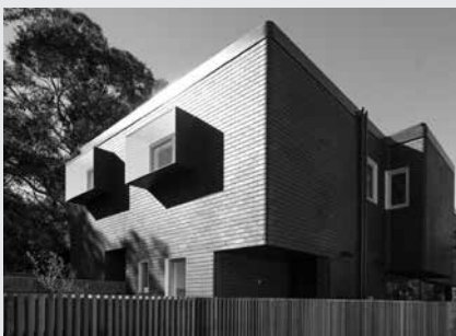
Design Award for Design Excellence for a Multiple Dwelling 23 Brown Street, Bronte 'Double House' Neeson Murcutt Architects