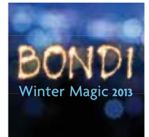
Bondi Winter Magic Page 6