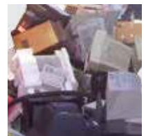
Council's waste and recycling services Page 10