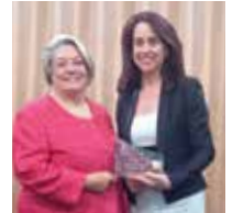
Council's 10 Point Plan Page 3