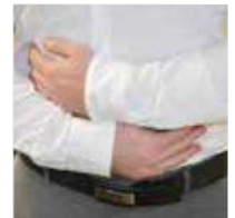
Stop gastro this Winter Page 7