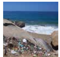
Stormwater Pollution Page 12

work as a family day care educator with waverley council Read more on Page 3