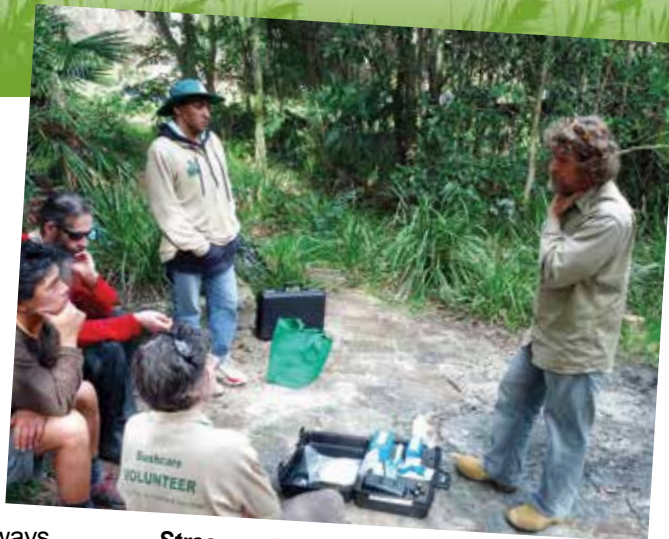
Streamwatch and local bushcare volunteers monitoring water quality at Bronte Creek.