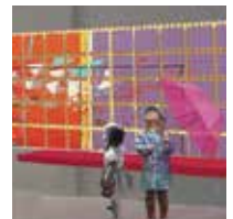
Enhancing Bondi Junction Page 8