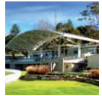
Recreation Centre turns one Page 9