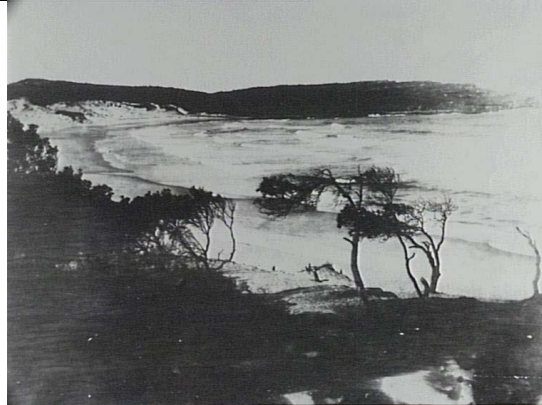
Bondi Beach 1875 – looking south to Ben Buckler

The southern and the majority of the northern end of Campbell Parade is located on Roberts' land with part of the northern end within the original grant to William Hurd. The southern end of Campbell Parade was previously called Waverley Street and Bondi Road, while the northern end was originally called Military Road. Campbell Parade was initially contemplated in a 1866 Reuss subdivision plan, and survey plan dated 1884.