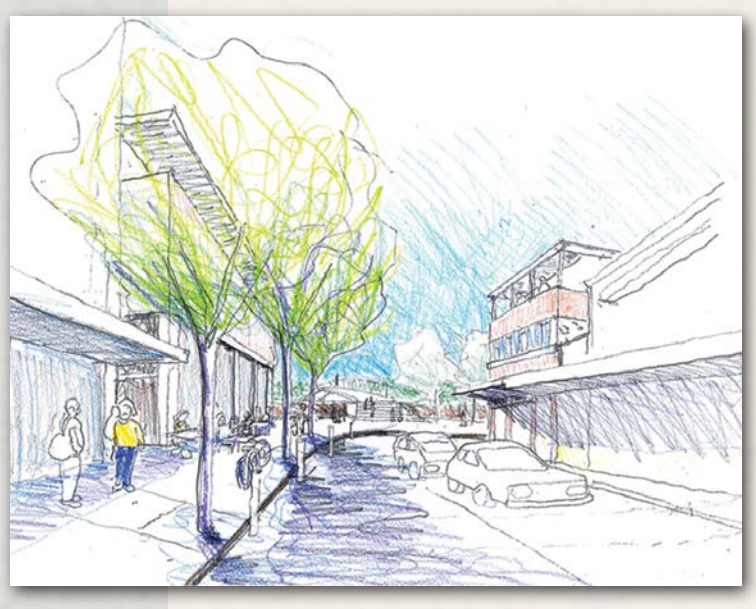
Pedestrianising Nelson Street