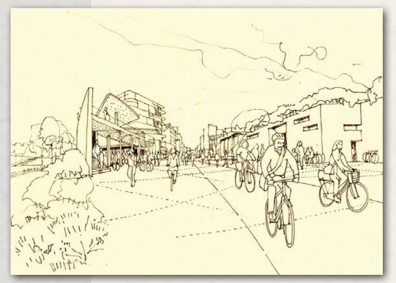
A cycle hub for Oxford Street

All your suggestions will be collected and a final report will be considered by Council at its December 2014 meeting.